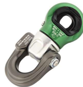
DMM SWIVEL FOCUS D